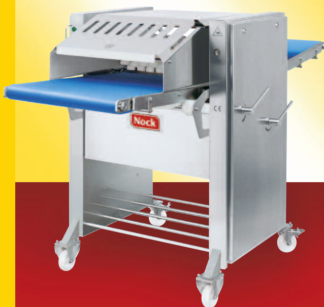
Photo: NOCK Cortex CBP 695 POULTRY with plastic modular belts (option)